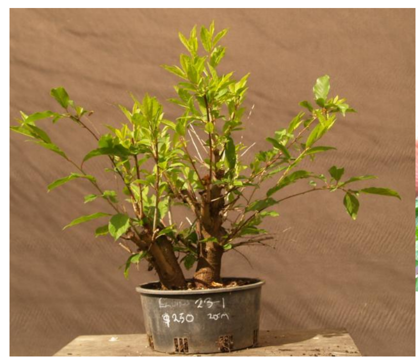
Prunus Elvins 23-1 20cm pot $250