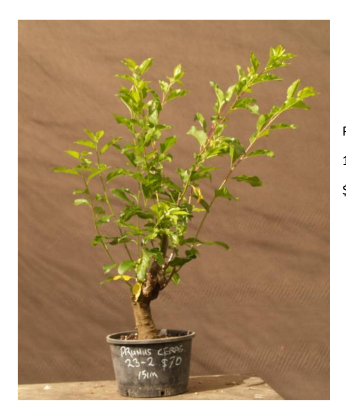
Prunus cerasifera 23-2 15cm pot $70

Prunus cerasifera grow as feral plums along roadsides, in paddocks and bush areas near Shibui Bonsai. All the following trees have been collected as wild grown seedlings - (Yamadori)