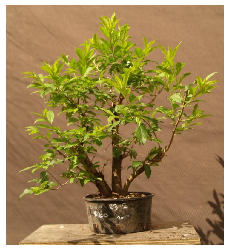
Prunus Elvins 23-2 20cm pot $200