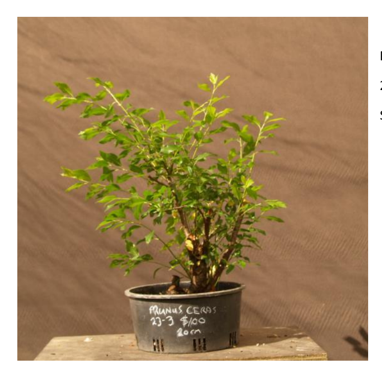
Prunus cerasifera 23-3 20cm pot $100