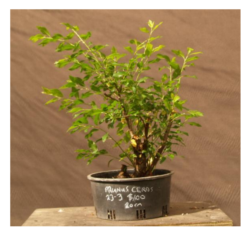
Prunus cerasifera 23-3 20cm pot $100