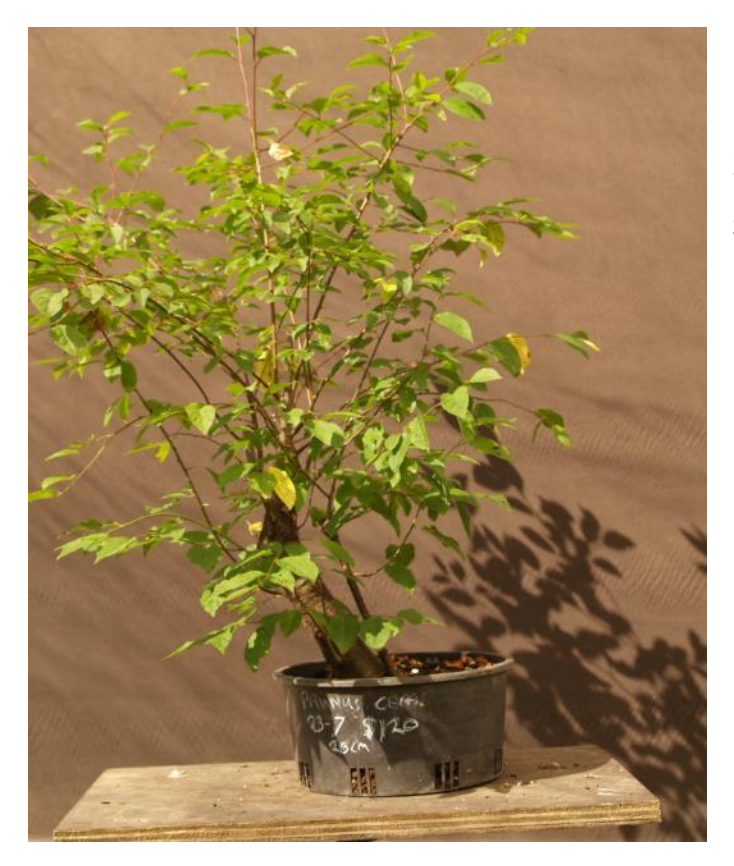
Prunus cerasifera 23-7 20cm pot $120