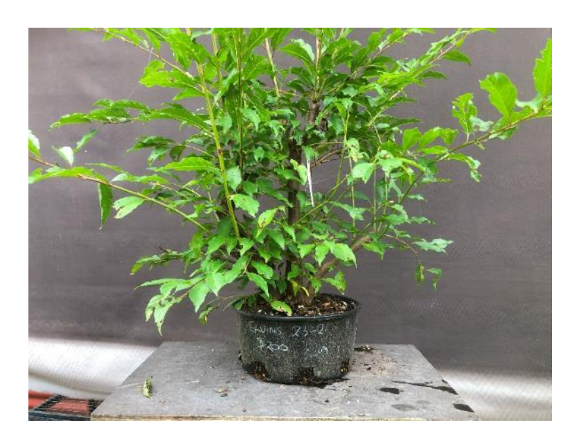
Prunus Elvins 23-2 20cm pot $200