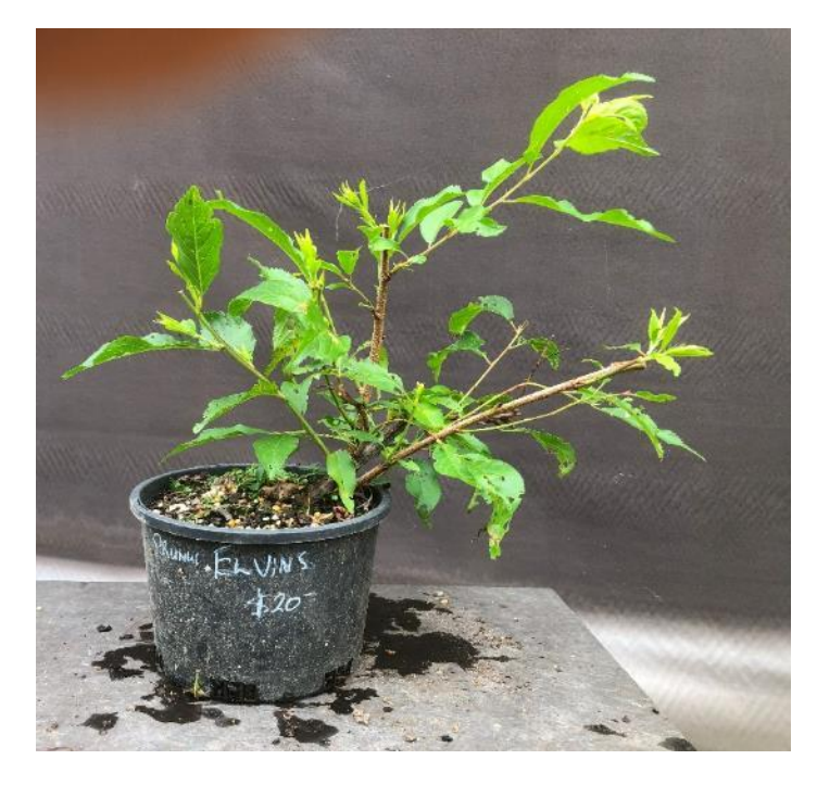
Prunus Elvins $20 15cm pot $20