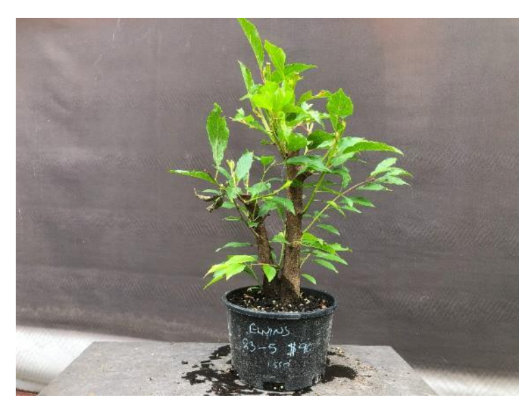
Prunus Elvins 23-5 15cm pot $90