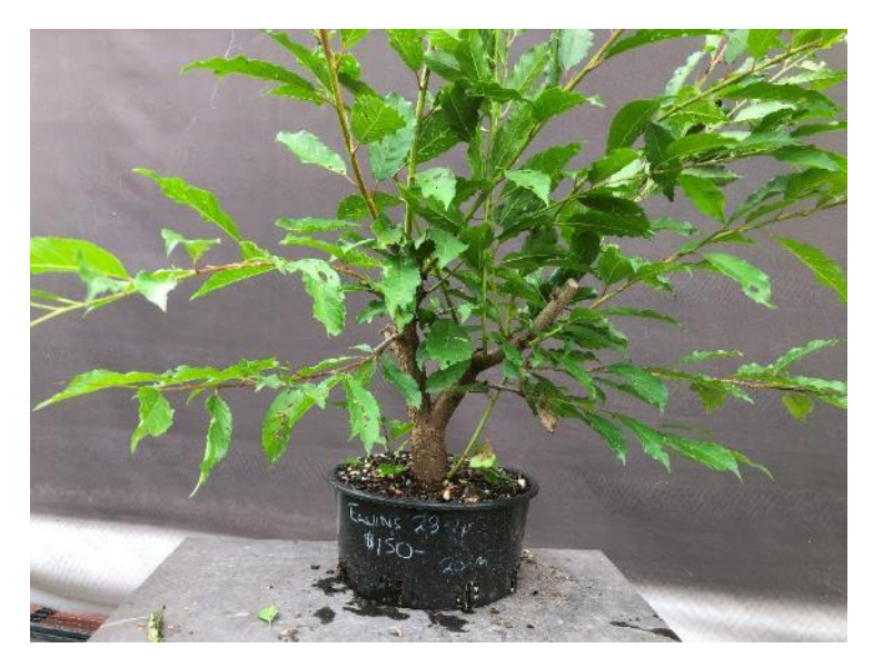
Prunus Elvins 23-4 20cm pot $150