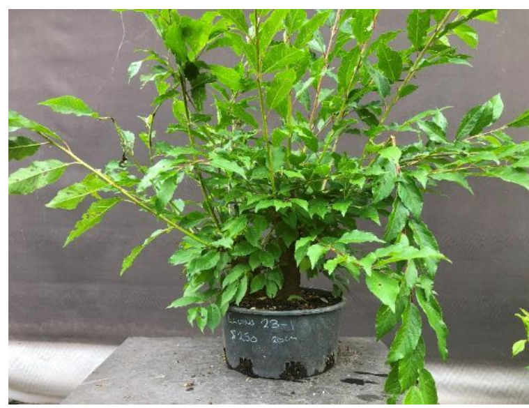
Prunus Elvins 23-1 20cm pot $250