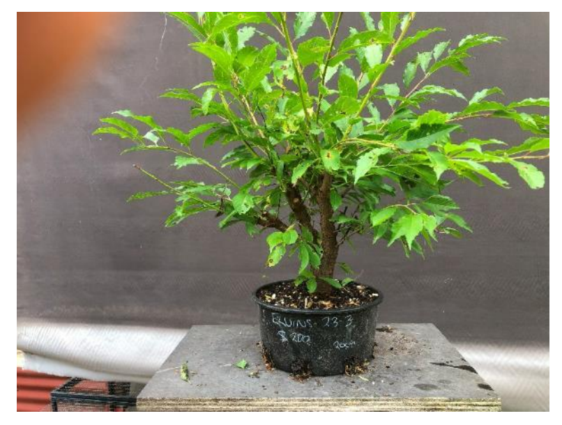
Prunus Elvins 23-3 20cm pot $200