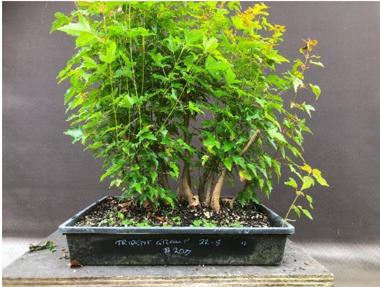
Trident group 23-5