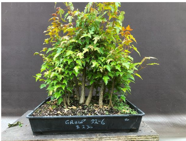
Trident group 22-6