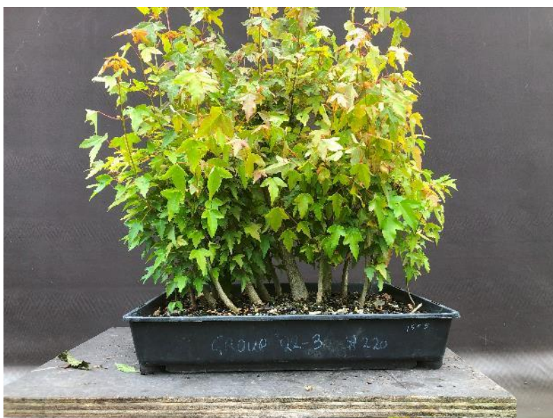
Trident group 22-3