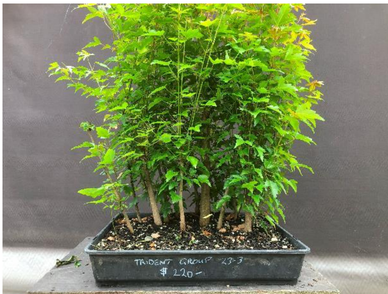
Trident group 23-3