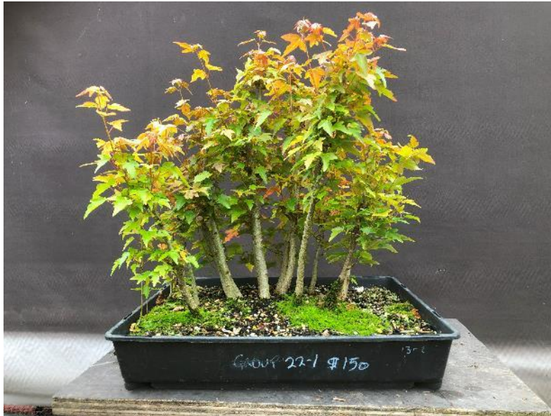
Trident group 22-1