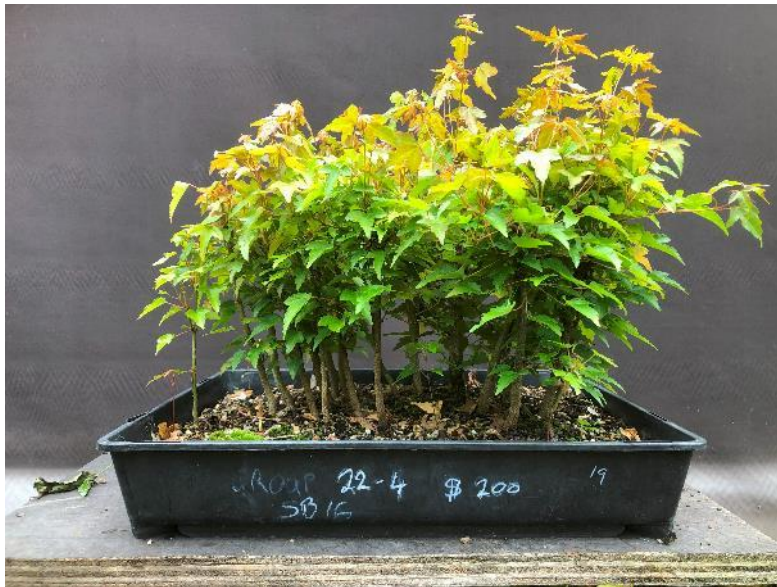
Trident group 22-4