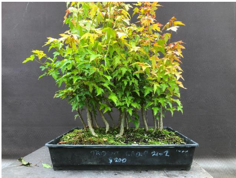
Trident group 21-2