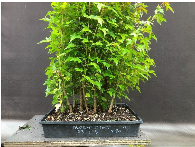
Trident group 23-1