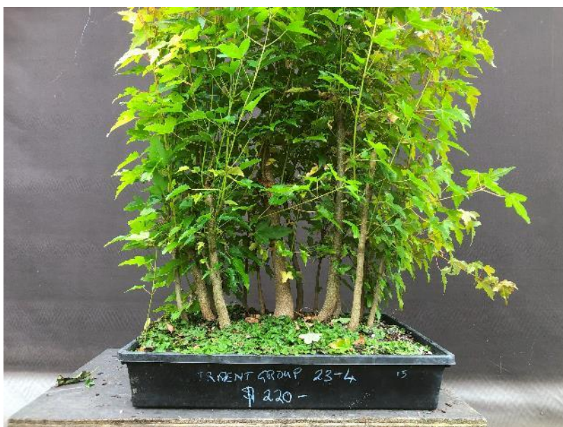
Trident group 23-4