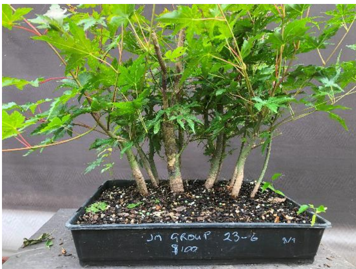
Japanese maple group 23-6