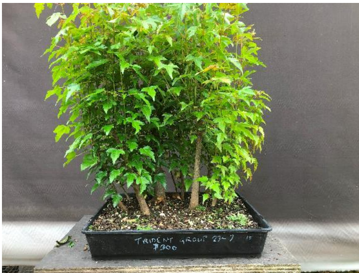
Trident group 23-7

Trunks with some subtle bends for more interest.