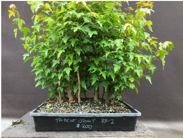
Trident group 23-2